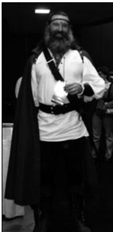
TAFP's 2005 President in costume.