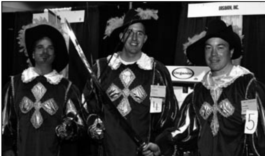
Organon: Winner of the best group costume contest.